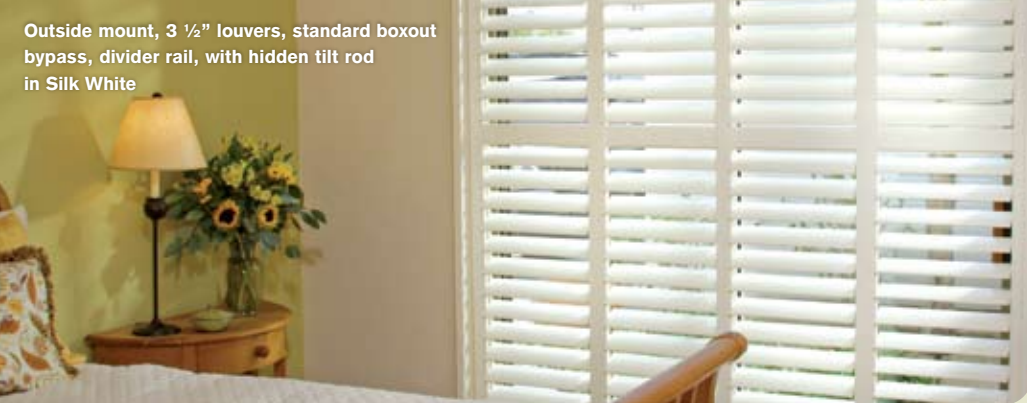
Outside mount, 3 1/2" louvers, standard boxout bypass, divider rail, with hidden tilt rod in Silk White