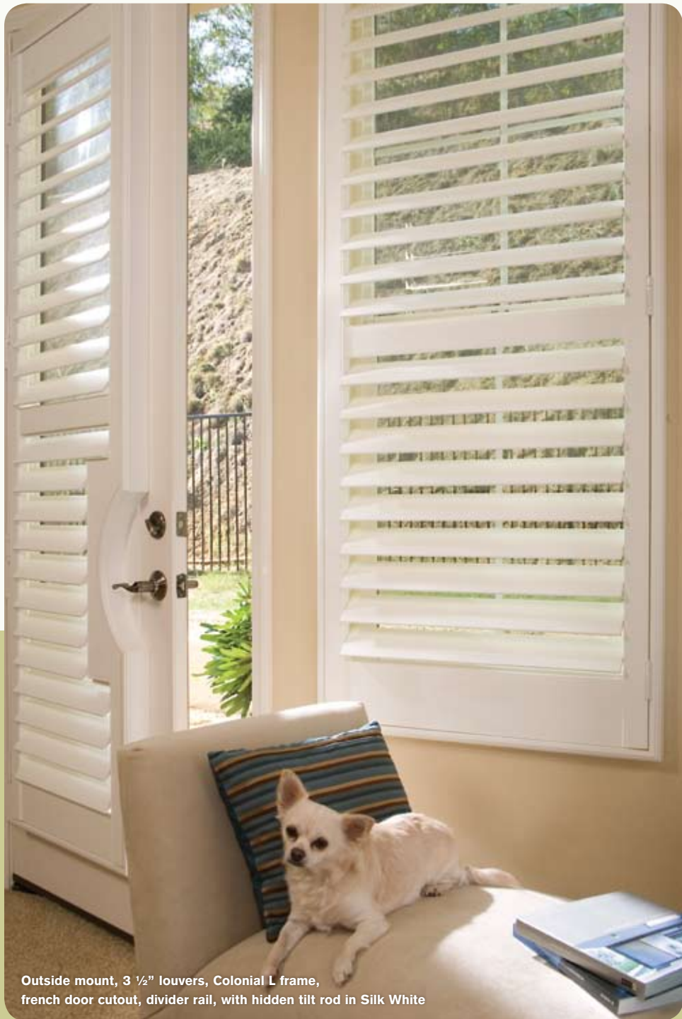
Outside mount, 3 1/2" louvers, Colonial L frame, french door cutout, divider rail, with hidden tilt rod in Silk White