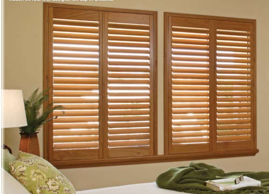
Outside mount, 3 1/2" louvers, 2" Camber Deco frame, hidden tilt rod, with designer sill cap in Chestnut