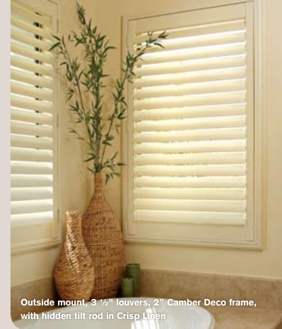
Outside mount, 3 1/2" louvers, 2" Camber Deco frame, with hidden tilt rod in Crisp Linen