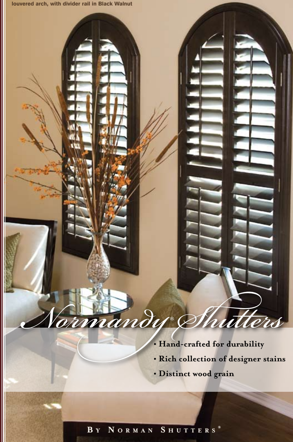
Outside mount, 3 1/2" louvers, 2" Camber Deco frame, louvered arch, with divider rail in Black Walnut