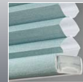
Fabric Wrapped Rails option