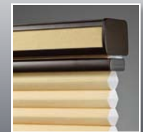
Designer Metallic Hardware option