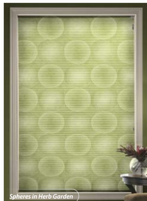
Spheres in Herb Garden

Anchored Gradient A white shade evolves into a bold color statement at the bottom of the shade.