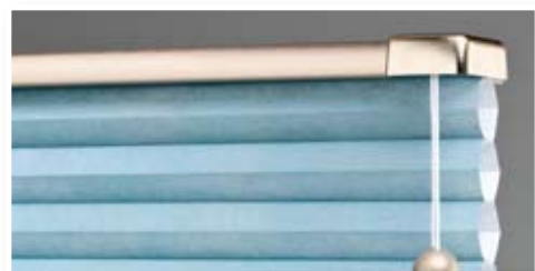
Standard Rectangular in Brushed Nickel