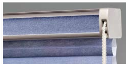
Smoothy in Brushed Nickel