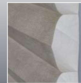
New 3/4" Tru-Cell™